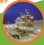
Keppel Merlimau Cogen